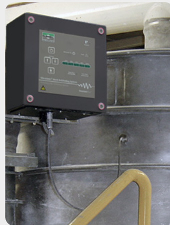
Ultrasonic deblinding for fine screening