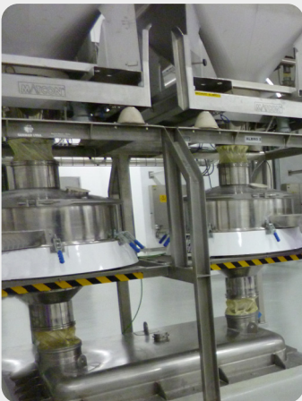
High capacity vibratory sieves