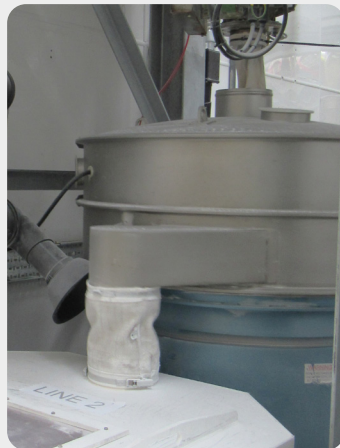
Vibratory graders for grading and sorting