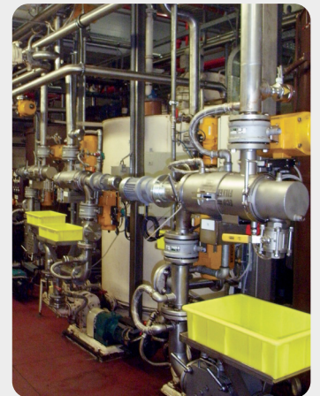
Self-cleaning liquid filters